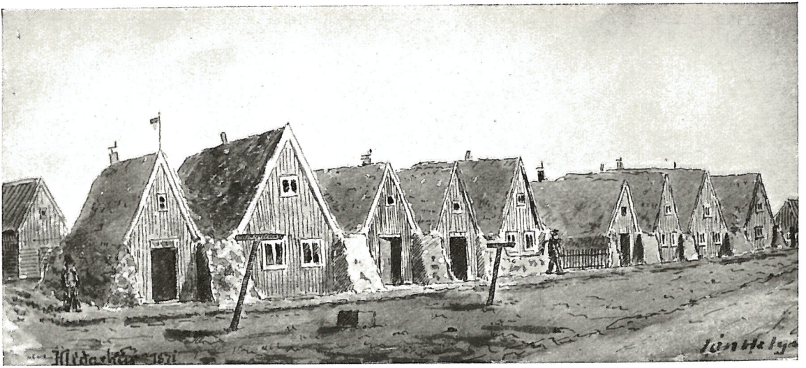
Nr. 47. Hlíðarhús um 1870 (austur eftir).